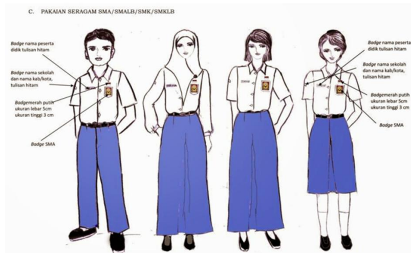
Figure 1. Official uniforms for SMAN and SMKN students according to the latest regulations (Kementerian Pendidikan, Kebudayaan, Riset, dan Teknologi, 2022).

voluntarily. This approach demonstrates an effort to balance institutional order with respect for individual autonomy. Section 2 (Pasal 2) outlines the foundational aims of the uniform policy, which include cultivating nationalism, fostering togetherness, strengthening solidarity among students, promoting equality regardless of socio-economic background, and encouraging discipline and responsibility. These objectives illustrate that the uniform policy is not merely a matter of appearance but a strategic tool for shaping school culture and reinforcing shared civic values.